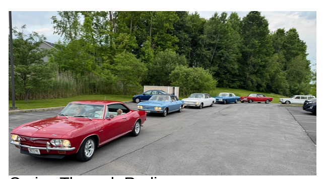
Cruise Through Radisson