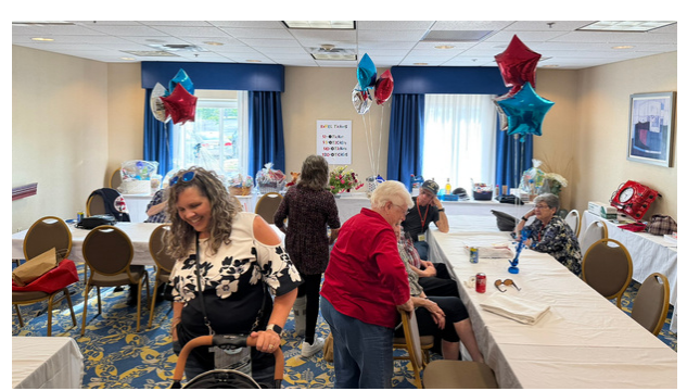
Hospitality Room Setup