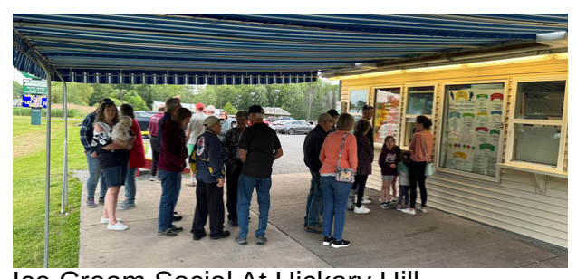
Ice Cream Social At Hickory Hill