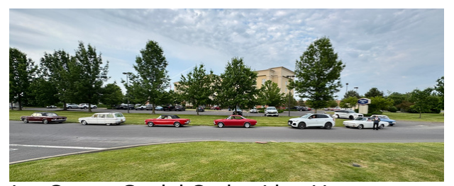
Ice Cream Social Cruise Line Up