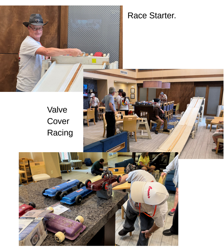
Weighing the Cars.

It was a perfect way to wrap up a day—and a weekend—filled with great cars, great people, and great memories. Looking forward to the 50<sup>th</sup> Corvair Recall in 2026!