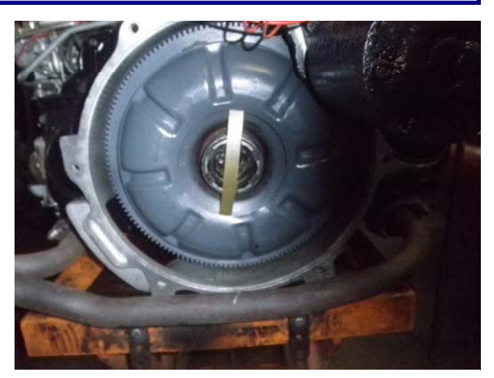
This shows a "tool" I made from an old diff sleeve and a piece of fiberglass to minimize wear on converter internals when running without a differential. I filled the sleeve with epoxy to seal it.