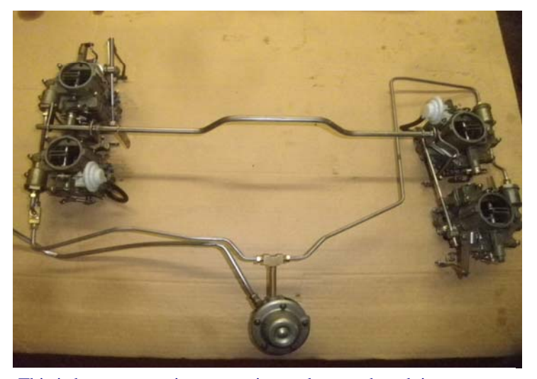
This is how to save time removing carbs etc when doing motor work. Remove as a unit. Just remember to check or replace base gaskets when reinstalling.