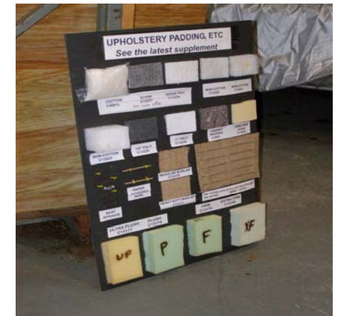
MARK DID AN EXCEPTIONAL JOB EXPLAINING SEAT REBUILDING