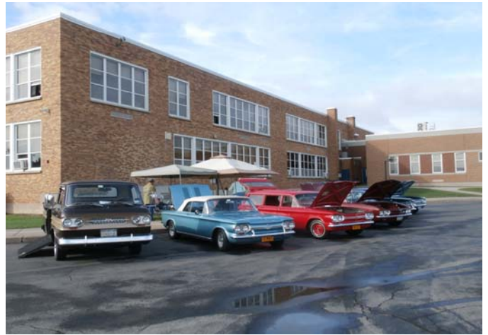
OUR GROUP AT THE JORDAN SHOW 2016