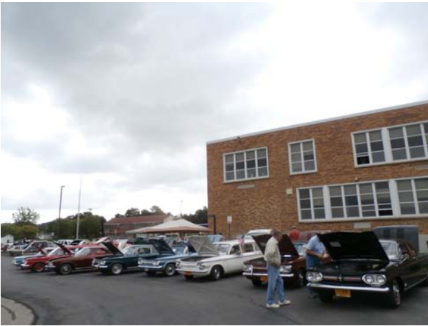
OUR GROUP AT THE JORDAN SHOW