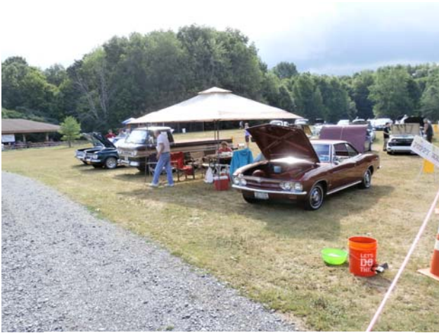
OUR GROUP AT THE VW SHOW 2016