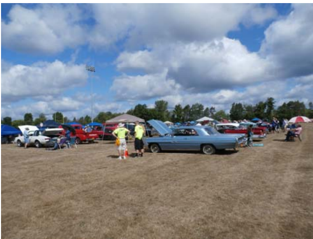
A small part of the Port Byron show this year