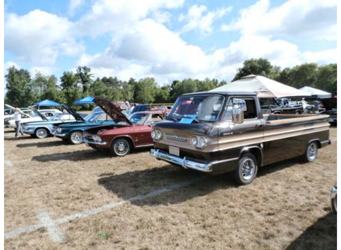
OUR GROUP AT THE PORT BYRON SHOW 2016