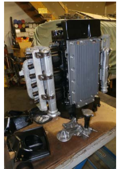
LATEST 180hp TURBO MOTOR IN PROCESS