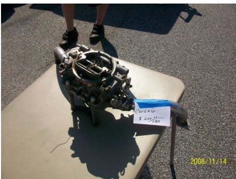
This is the center mount 4 barrel carb setup for a Corvair motor sent in by Len Smith.