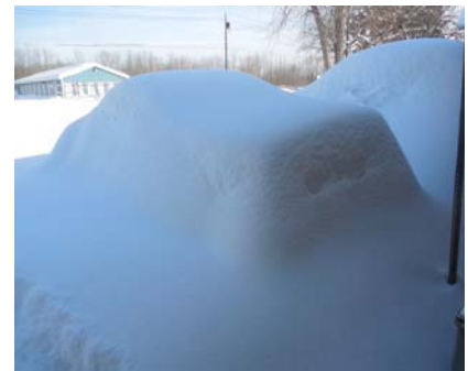
These pictures are from in front of Ron's shop near Port Byron