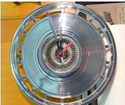
A neat looking clock , now in my shop. It was made with an extra 64 Spyder hubcap from my collection by Rod Murray of Pitts- burg area PA.