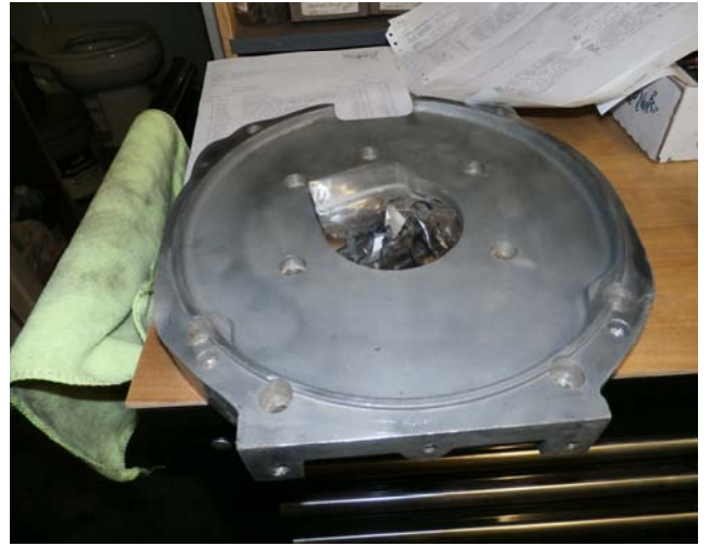
Corvair to VW adapter now for sale $50 see Tim