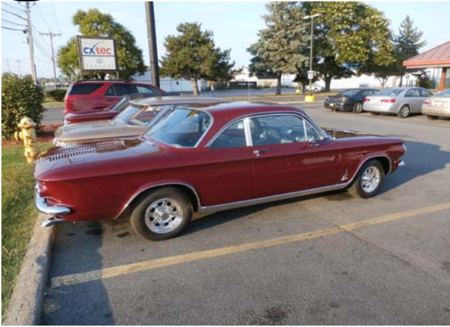
PHIL'S 64 SPYDER FRESH FROM DAVE'S SHOP