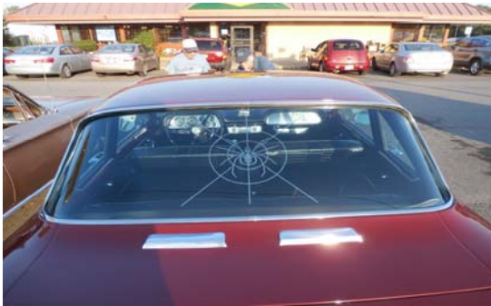
18 CORVAIRS at WAMPSVILLE 2014 >