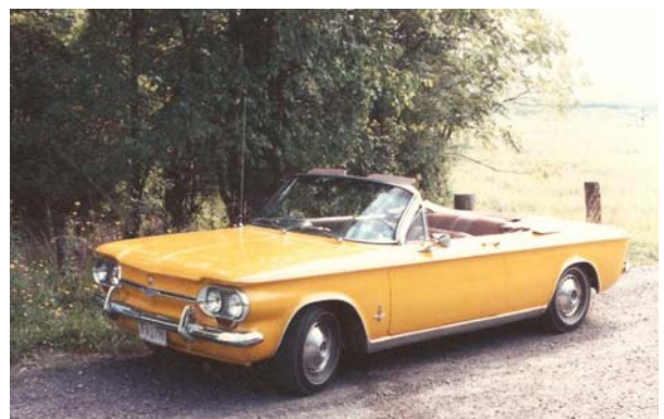
Tina Gaffney found this picture of a 64 Convert with tan interior and a non factory yellow color in her collection. She has no idea who owns this car? any ideas??