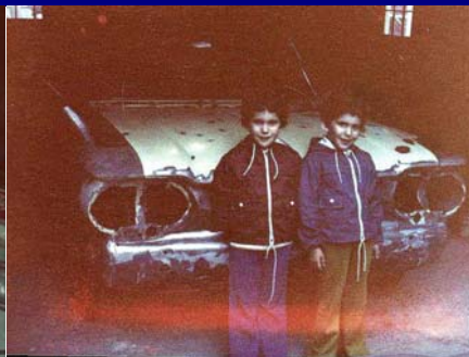
Memories from @1973