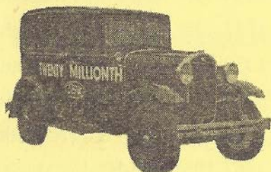
1931 Model A Town Sedan