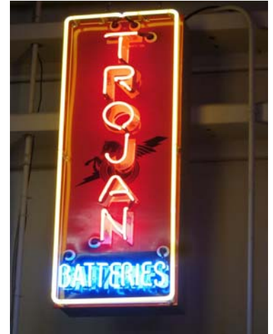
A FEW MEMORIES FROM THIS YEAR AT RECALL 2014