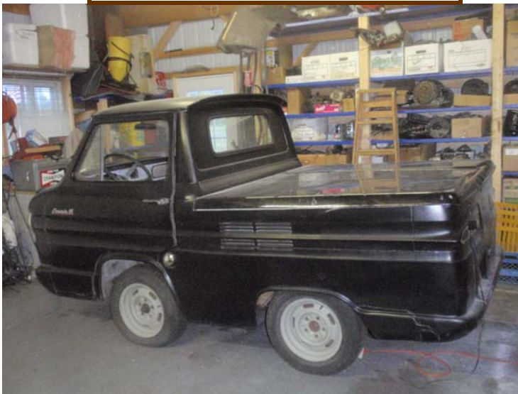
CRAMPY AS STORED FOR NOW