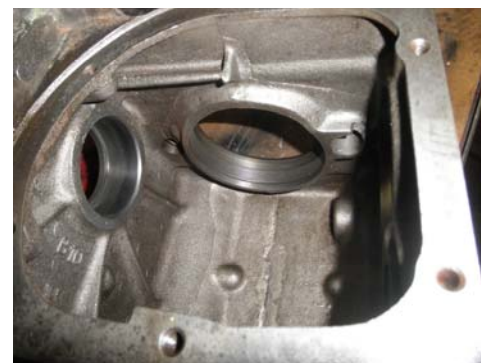
Motor was removed incorrectly Differential throwout sleeve cracked