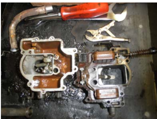
“Was not running well after fillup”