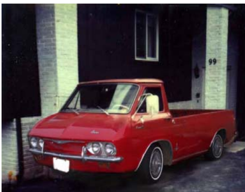
This photoshop from a long time ago still comes back to me with questions... This was originally a 35mm picture of the rampy the day we brought it home.

Regards, May all your electrons and oil drops go where they are supposed to...Tim Colson