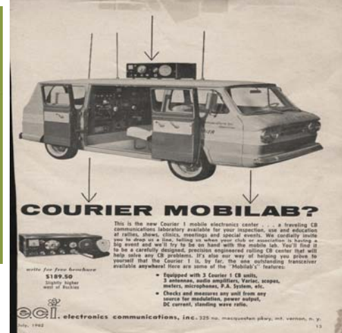
This is what I should have done with the greenbrier I sold a few years ago