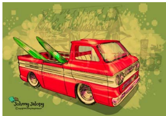
This is just plain "art" recently found on the net by a good friend.