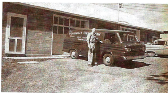
Circa 1962. This Chevrolet Corvan is the first delivery truck the farm had to deliver its products to restaurants and stores. The business was much smaller at that time and we had three or four delivery routes each week. We called the customers on Monday to obtain their needs for the week.