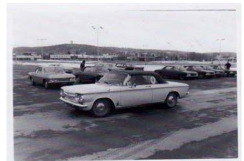
64 Spyder Convert at a winter C N Y C C meeting . Most people were still driving Corvairs as the main ride!