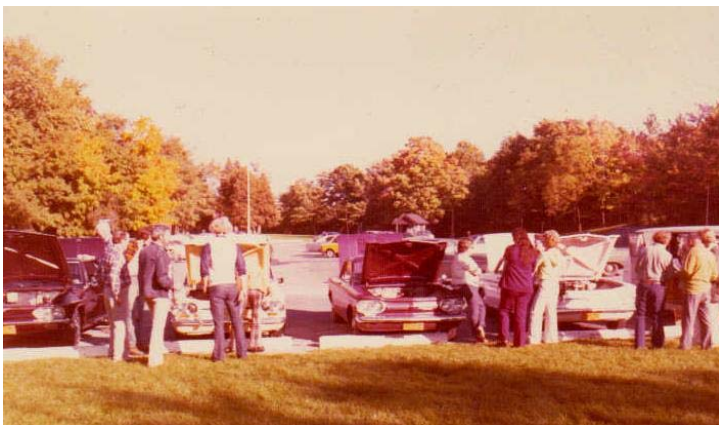
The first time we showed the 64 spyder convert CNYCC at Clark's reservation in Jamesville. @1974?