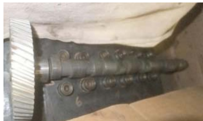
A sample of the things For Sale