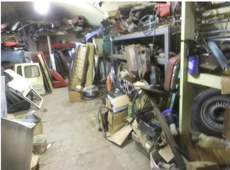
A sample of the things For Sale out back at Ron's building