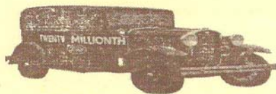
1931 Model A Town Sedan