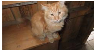
HILDENE's VERSION OF "GARFY"