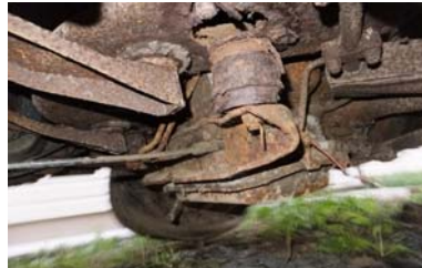
TALK ABOUT RUST DAMAGE!!