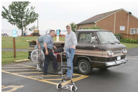
YES I USE MY RAMPY!