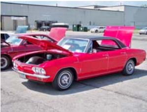
THIS CAR IS FOR SALE AT A REDUCED PRICE!!