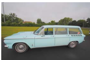
A FEW PICTURES FROM THE RECALL 2011