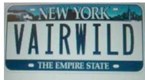
CORVAIR SPYDER Conv. 1964, red/red interior, white top, turbo, wires, excellent shape, $15,000. (315)299-6757