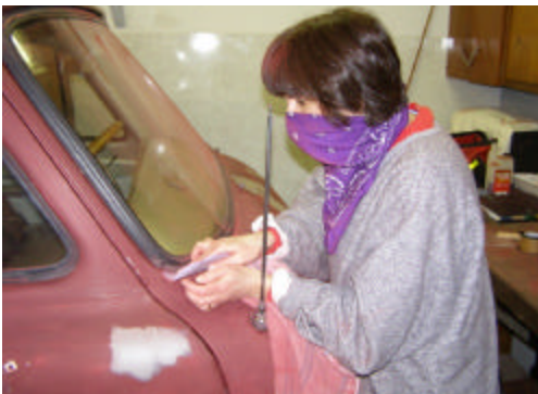
NICE DETAIL WORK!