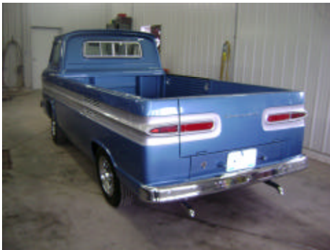
THE SOMEDAY LAKEWOOD (saved from the crusher!!)