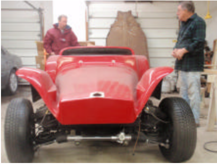
PHIL'S NEW "TRAILER QUEEN"