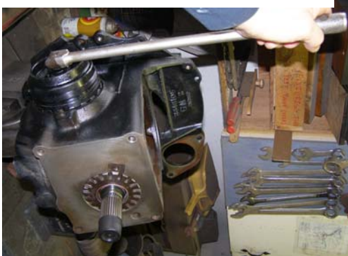
MY NEW DIFFERENTIAL TOOL

FOR SALE N.O.S. 60-63 rear bearing $120.00 shipped FIRM postal m.o. Call tim at (315)415-4243 or email me