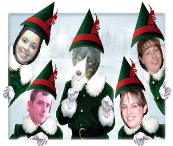
PHIL's "ROWDY BUNCH" holiday card