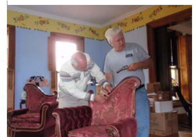
MOST OF THIS YEARS WAMPSVILLE GROUP AT SMITH'S