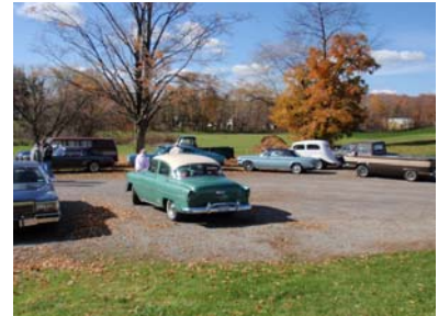
PHIL IN THE RIGHT PLACE FOR GREAT PICTURE TAK- ING>>>