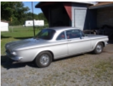
RON'S 62 SPYDER with the wire wheels