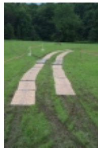
THE VW SHOW WAS ALMOST A WASHOUT BUT THEY ENDURED FOR A GOOD TIME!