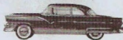
1965 Fairlane Club Sedan