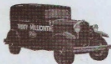
1931 Model A Town Sedan