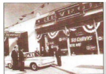
This photo taken at Pope Chevrolet Auto Dealer in 1960 which was on Tremont Avenue west of Westchester Square. Notice all the salesmen gathered outside to inspect a brand new 1960 Chevy that just arrived. The showroom window lets the public have a look at all the other models of Chevrolets that are available to all the increasing number of Bronxites who want to own a car.